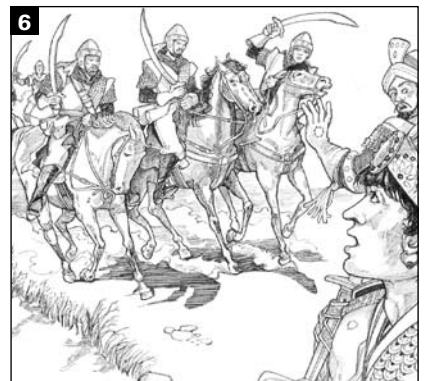
The Sultan's men were coming with swords in their hands.