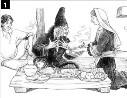
Aladdin's mother put meat, rice and fruit on the table.