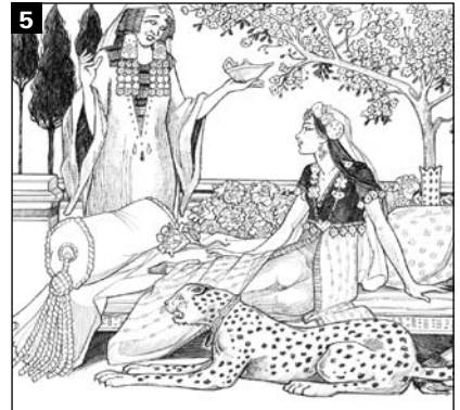
'Aladdin can have a nice new lamp,' laughed the princess.