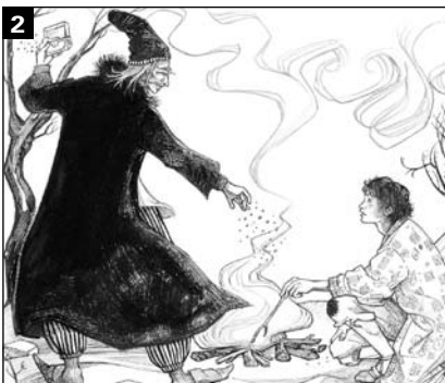
Abanazar put some powder on the fire.