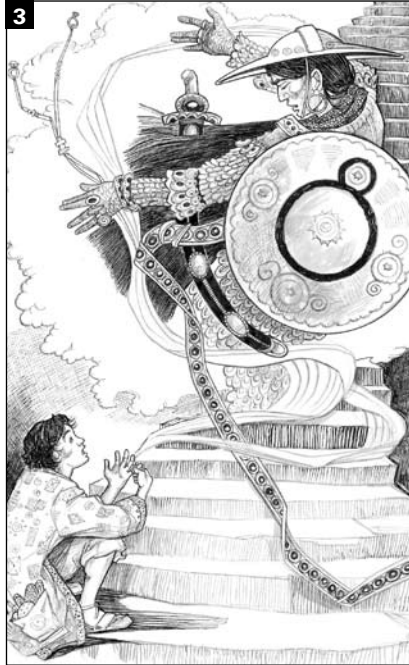
Out of the smoke came a big jinnee.